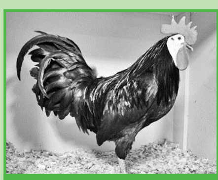
White Faced Black Spanish male