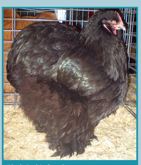
Black Cochin female