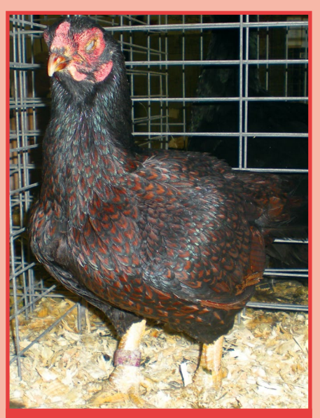
Dark Cornish female