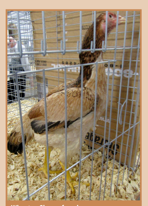
Wheaten Shamo female