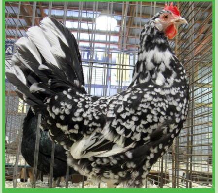
Single Comb Acona female