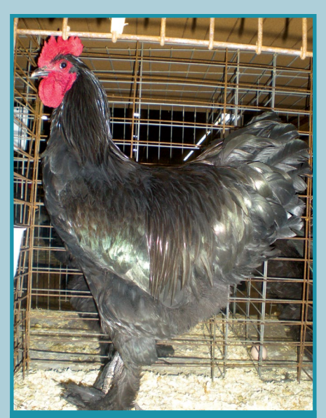
Black Langshan male