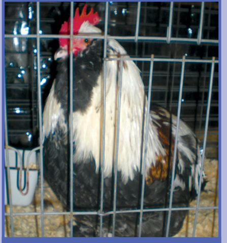
Salmon Faverolle male