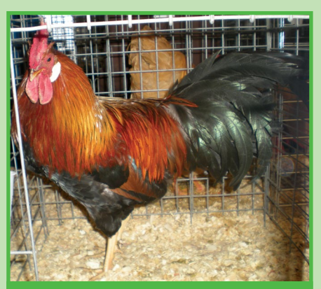
Rose Comb Light Brown Leghorn male