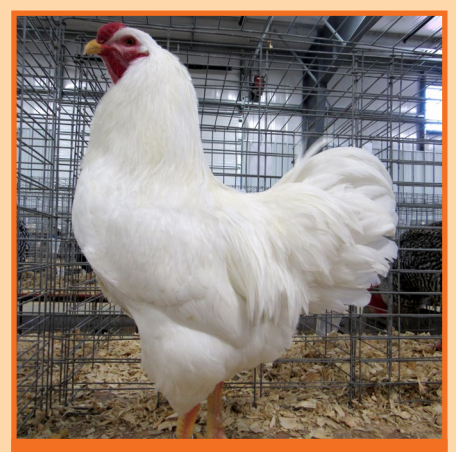
White Chantecler male