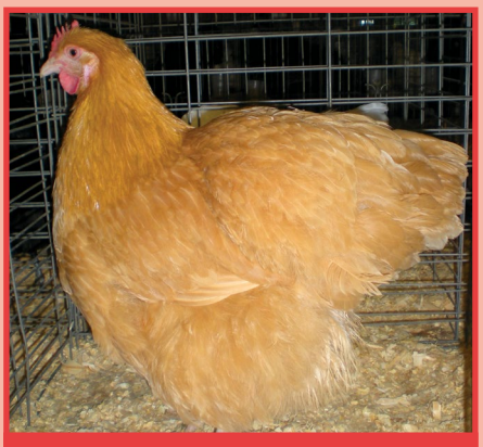
Buff Orpington female