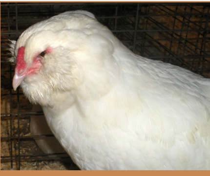
White Ameraucana female

Note that many hatcheries will sell Ameraucanas/Easter eggers. Easter eggers are a cross of Ameraucanas and another breed to get the desired egg color. Leg color is important on this breed, and yellow soles on the feet are considered a disqualification.