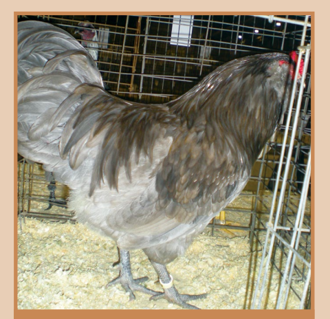
Blue Ameraucana male