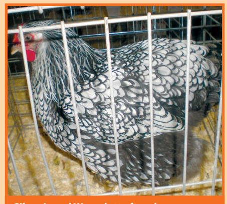
Silver Laced Wyandotte female