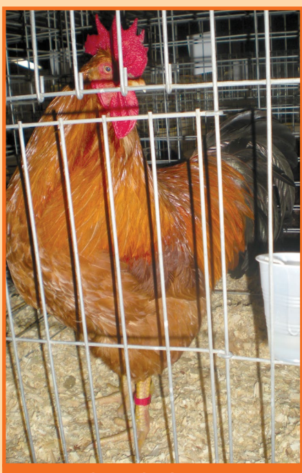
New Hampshire Red male