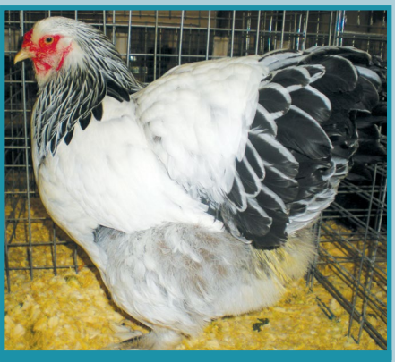
Light Brahma female