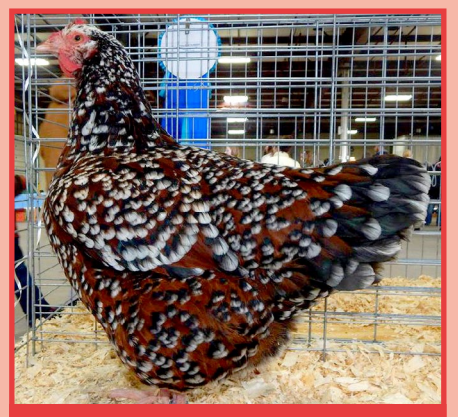
Speckled Sussex female