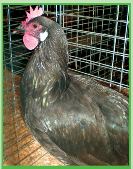
Single Comb Black Minorca female