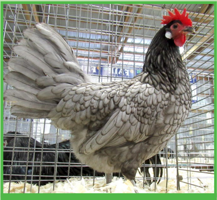
Blue Andalusian female