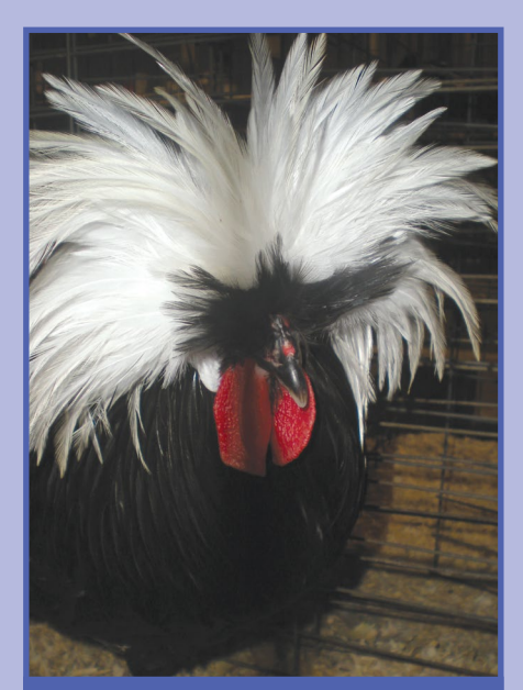
Non-Bearded White Crested Black Polish male