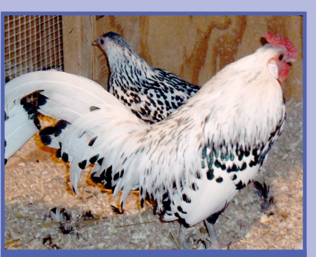
Silver Spangled Hamburg male and female

Sicilian Buttercup: A small, spritely breed from Sicily, their chief distinguishing feature is their cupshaped comb. Sicilian Buttercups are non-broody, lay a fair number of small eggs, and are kept strictly as ornamental fowl.