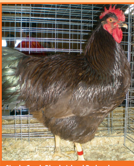
Single Comb Rhode Island Red male

Skin color: Yellow. Eggshell color: Brown. Use: Meat and eggs.