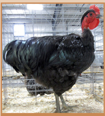
Black Naked Neck male